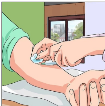
Pre-Injection Site Preparation