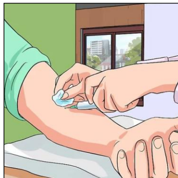
Pre-Injection Site Preparation